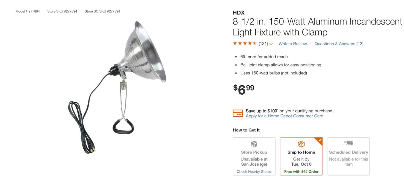
Figure 1 "Clamp light" Available at Home depot.